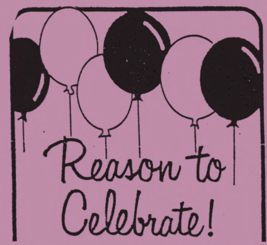
AN ADDITION TO THE DAWSON FAMILY

BIG BLUE DISK comes in a two-disk format and costs $9.95 for each monthly issue. Subscriptions are available from BIG BLUE DISK, P.O. Box 30008, Shreveport, LA 71130-0008. (6 months for $39.95; 1 year/$69.95). System requirements are: DOS 2.0 or higher, 256K RAM.