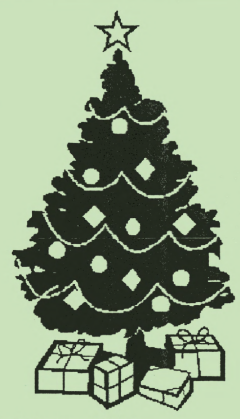
Christmas, 1994 -Christmas 1984

It is that time of the year for me to get sentimental about Junior. It was ten years ago, Christmas season of 1984, when IBM reduced prices on the PCjr making it possible for many of us to move up into a "real" computer. I know that many of you purchased your new computer, worked with it, learned the ins and the outs of DOS and then moved on "up" to the XT or to an AT class machine and never looked back.